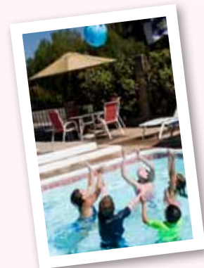
Casa Ojai Inn