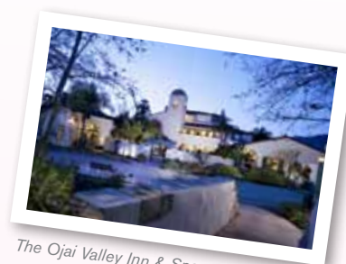
The Ojai Valley Inn & Spa