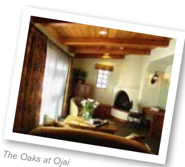
The Oaks at Ojai

Located in Oak View, the Oakridge Inn is the closest motel to the fishing haven of Lake Casitas.