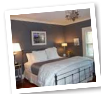
The Lavender Inn